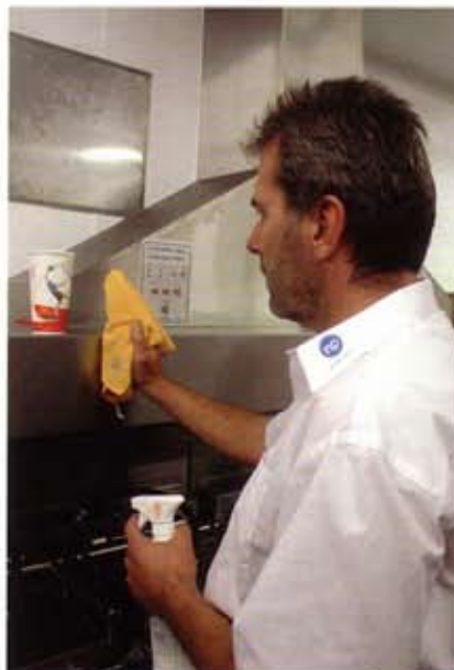
Many food prep areas have already been treated with the easy clean coating

or potentially harmful engineered nanoparticles